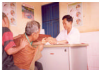
A health staff carries out a rapid diagnosis test and found he has malaria.