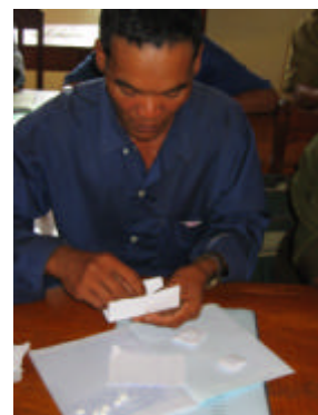
Demonstration by a participant on how to prescribe anti-malaria drugs.

During the workshop, the IEC team found that training for village volunteers needs to be strengthened to ensure that village volunteers can prescribe and advise patients on how to take anti-malaria drugs properly. A participatory approach will be applied into village volunteer training.