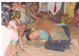
A man has headache, fever and chills.