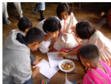
Children are discussing IEC materials that will be used to educate them on malaria.

The Karen, are the group that the Thai team is working with. The team has identified adult men, forestgoers, visitors and children, as populations to focus on. With the target groups, the team has been developing IEC materials that can be used by malaria health worker, village leaders, the village microscopist, housewives and teachers. Participatory materials production workshops were organized to encourage participation from target populations to develop materials to suit their needs and situation.