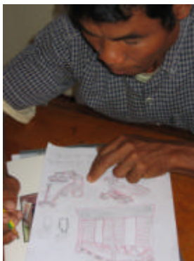
A participant is drawing a picture to go along with a story.

The Lao IEC team organized a four-day workshop, with Lave and Taliang ethnic groups from Phouvong and Sanxay Districts of Attapeu Province, at the end of January 2004. In the workshop they developed a draft flipchart, songs, calendar/poster and storyline. These materials will be utilized through existing village structures like village heads, village health volunteers, women's and youth union members, and existing local health system structure, for example, health centre staff, district health personnel, and district and provincial health mobile teams.