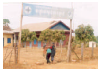
He is taken to local hospital / health centre.