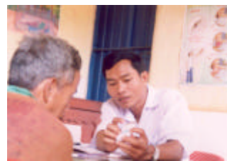
The health staff prescribes anti-malaria drugs and instructs the man on how to take the drug.

A technical consultation meeting was organized from 2-4 February 2004. It aimed to bring all country teams together to share their field IEC development experience and learn from each other ways to improve the quality of the materials; increase the IEC country teams' knowledge of how to design appropriate artwork for their print