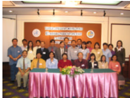
IEC technical consultation meeting participants from six countries, including representatives from JICA and IMC.

materials; and improve and finalize their draft materials for field-testing with target populations. The participants included 6 country IEC teams, artists, and representatives from JICA malaria control programme in Myanmar and International Medical Corps, Southeast Asia. The IEC country teams have found participatory IEC materials production is useful and appropriate to the need and situation. It has given team members an opportunity to see how target populations see and perceive malaria issues.